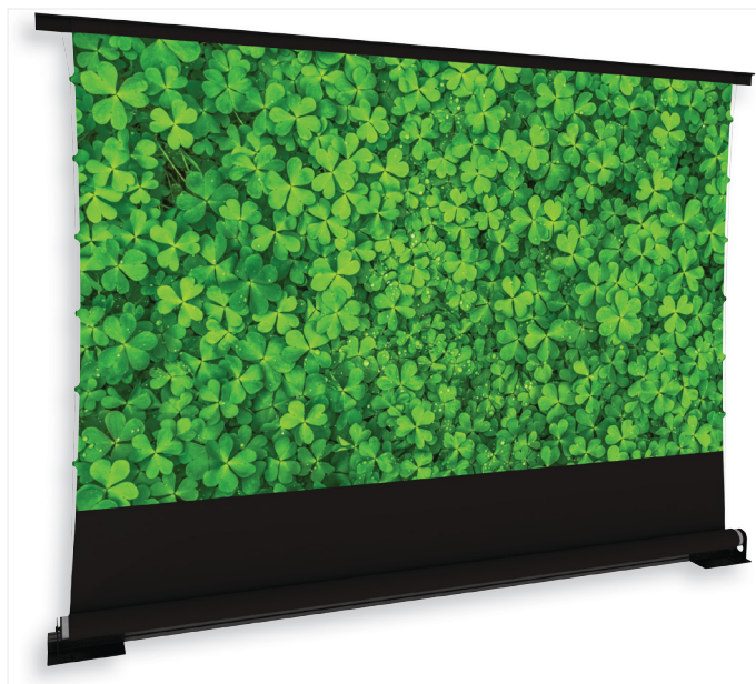
DAVINCI OPEN SYSTEM