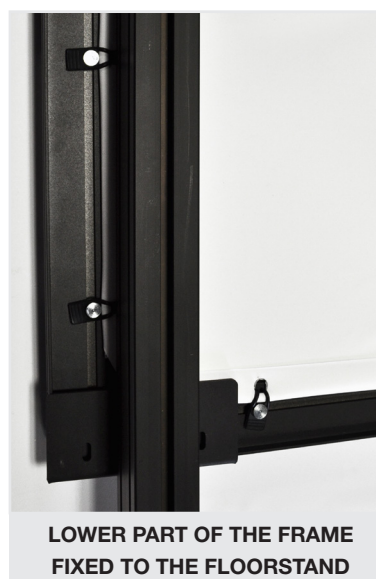
LOWER PART OF THE FRAME FIXED TO THE FLOORSTAND