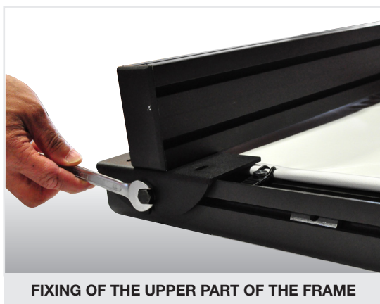
FIXING OF THE UPPER PART OF THE FRAME

For large screens from 600 cm. of width on, which need three legs, the central floorstands has to be always mounted at the rear side of the frame but fixed both on the upper and lower horizontal frame parts of the FlatMax.