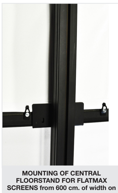
MOUNTING OF CENTRAL FLOORSTAND FOR FLATMAX SCREENS from 600 cm. of width on