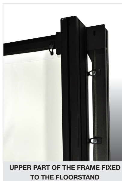
UPPER PART OF THE FRAME FIXED TO THE FLOORSTAND