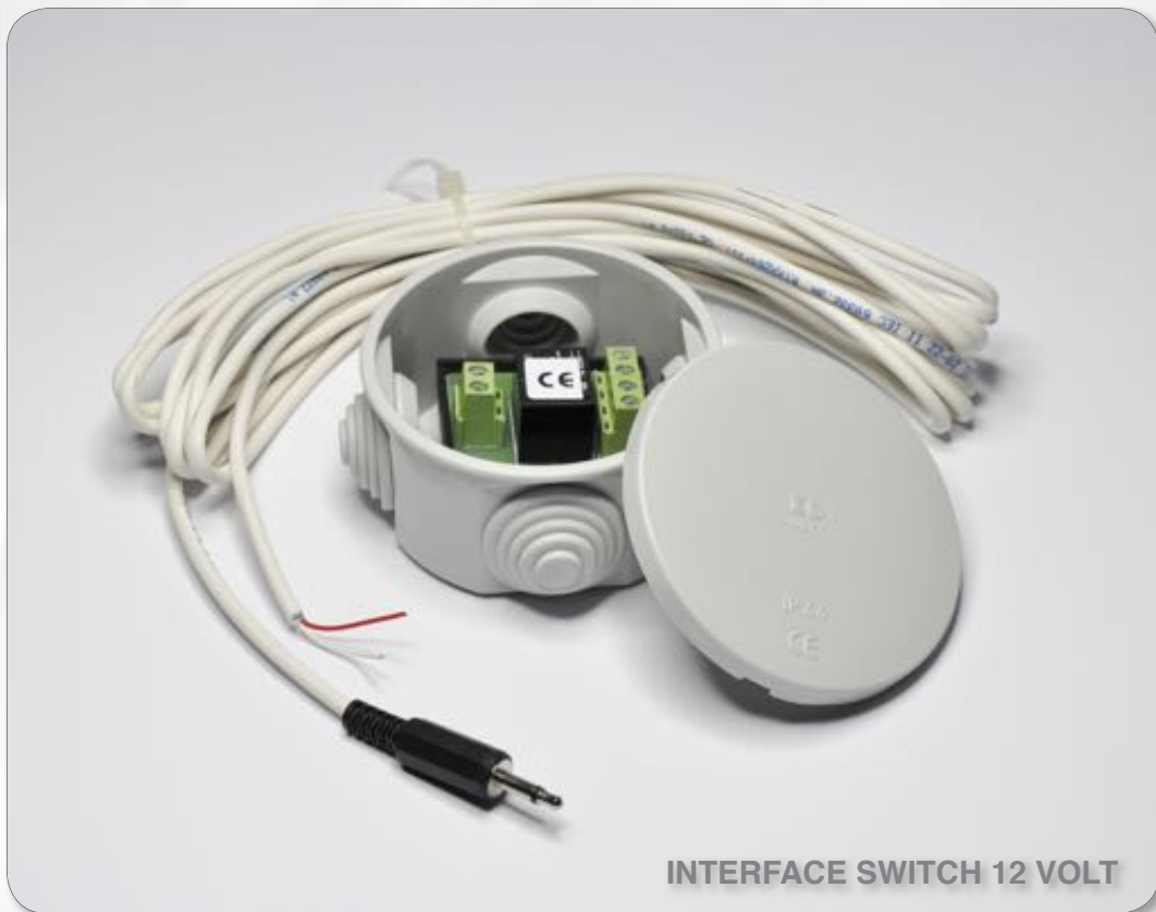
INTERFACE SWITCH 12 VOLT